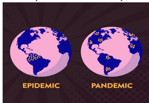
Figure 1: Epidemic vs pandemic