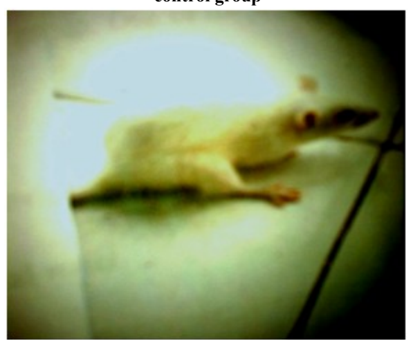
Fig I: Healthy Albino rat ( Rattus norvegicus )- from the control group