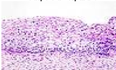
Figure 1: Showing slide of Cervical intraepithelial neoplasia I.

2. CIN II or HSIL: Moderate dysplasia confined to the basal 2/3 of the epithelium.