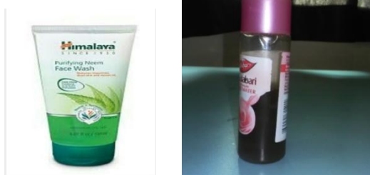
Figure 1: Marketed Face-wash