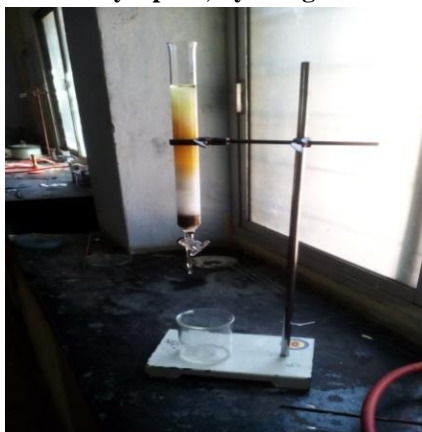
Figure 1: column chromatography in Citrullus lanatus