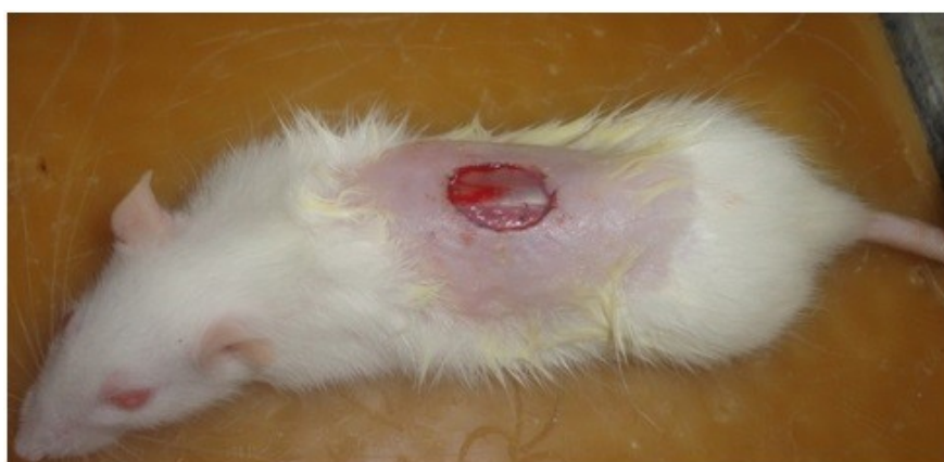
Figure 1: Excision Wound Model.

The animals were divided randomly into nine groups of six rats each. Group 1 was left untreated served as (Blank); group 2 was treated with Cipladine (Povidone-iodine) ointment and served as a reference (Allopathic Standard); groups 3 was treated with Durva Ghrita ointment served as (Ayurvedic Standard); group 4 was treated with the Ghrita Base served as (Control); group 5 was treated with Hydrophilic Base served also as (Control); group 6 was treated with FM- 1: 7.5%, group 7 was treated with FM- 2: 10%; group 8 was treated with Oleaginous Base also served as (Control); group 9 was treated with FM-3: 10%, all these group {6,7, & 9} were served as (Test), and treated topically with the respective ointments & ointment bases, till the epithelialization was complete. The percentage of wound closure and period of epithelialization were recorded.