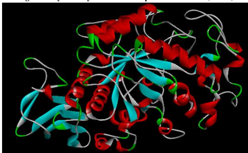
Fig. 1: \alpha -amylase enzyme from RCSB protein data bank (1HNY)

The ligands such as 4-methyl esculetin, genistein, herbacetin and the standard acarbose were built using ChemSketch and optimized using “Prepare Ligands” in the AutoDock 4.2 ( Fig.2 ). The optimized ligand molecules were docked into refined \alpha -amylase enzyme using “LigandFit” in the AutoDock 4.2.