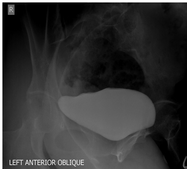
Figure 2 Cystography showing the thin stream of dye indicating fistula in left anterior oblique view