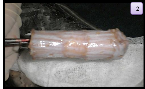
Acrylic mould with skin graft