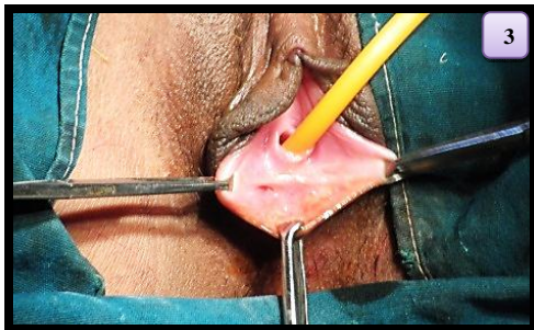
Vaginal agenesis before surgery