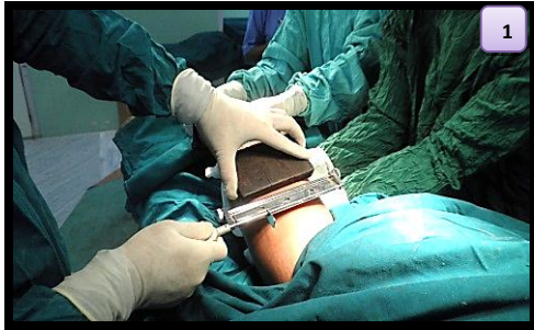
Partial thickness skin graft