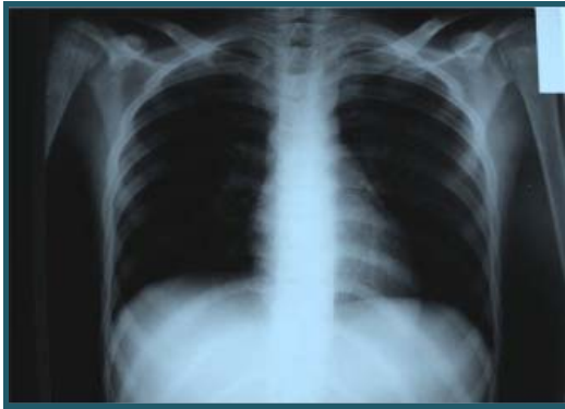
Figure 5- Eight days after removal of the chest drain; pneumothorax has resolved completely. Immediately an Intercostal drain was inserted and after 20 minutes, patient became stable with pulse rate of 86/min, Blood pressure of 140/100 mm Hg and spo2 of 90%.

Follow up chest X-ray showed decreased pneumothorax with Intercostal drain in situ (Figure-3). Patient was shifted to surgical intensive care unit (SICU) for monitoring.