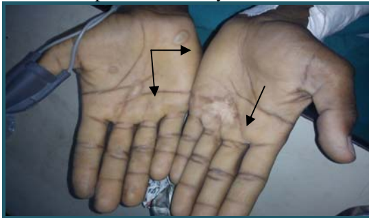
Figure 1- shows site of entry and exit wounds

There was superficial to deep burn wounds on palmer aspect of both hands (Figure - 1). Other systemic examinations were within normal limit. His Electrocardiograph (ECG) was normal except for sinus tachycardia.