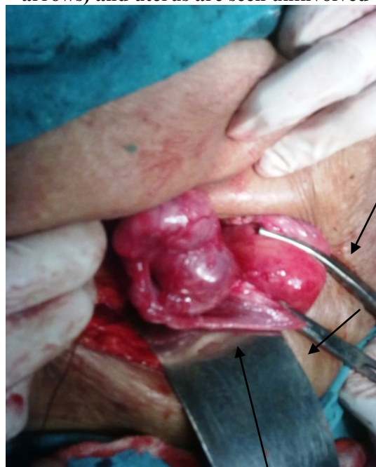
Figure 1: Primary Fallopian tube cancer (long black arrow), both ovaries (short black arrows) and uterus are seen uninvolved