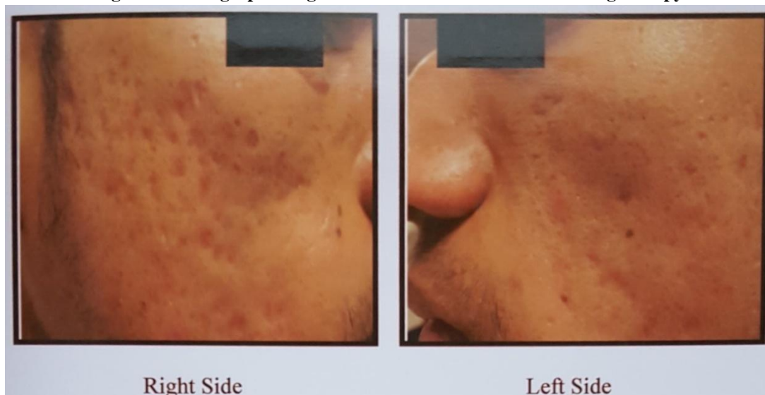
Figure 2: Photograph of right and left side of face after 1 st sitting of therapy.