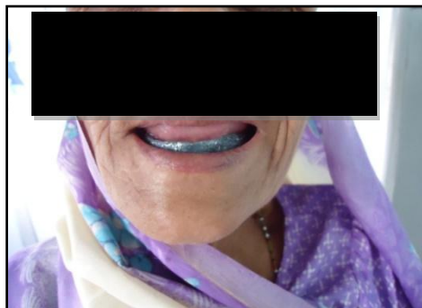
Figure 4(a): Pronouncing sound aaa

The lower special tray with the softened admixed compound in a 65o C water bath. was placed in the patient’s mouth; this tray was very carefully adjusted in the mouth to be sure that it was not overextended and remained stable during opening, swallowing, and speaking. The patient was then asked to talk and pronounce mainly three sounds i.e. aaa, eee, ooo, swallow, drink some water, etc. fig.4 a, b, c, d