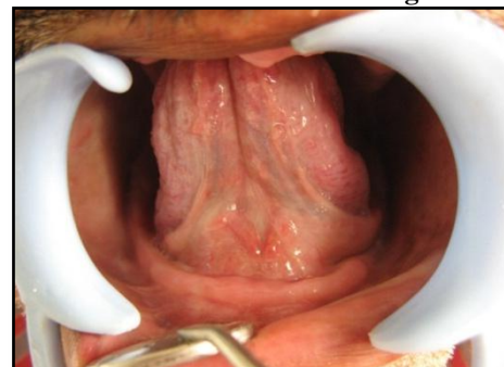
Figure 2: Severely resorbed mandibular ridge