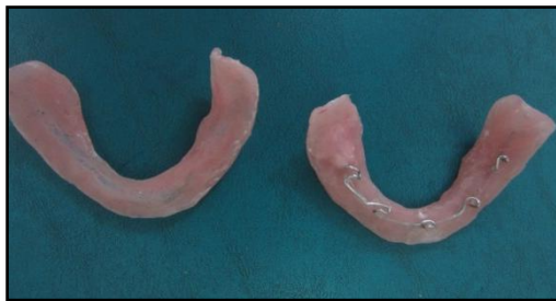
Figure 3: Denture base was fabricated with wire loops

Maxillary final cast was fabricated by the conventional manner but as lower ridge was highly resorbed, recording of neutral zone was planned to record that, denture base was fabricated with wire loops embedded in it for holding the admixed impression material during al movements. (Figure3)