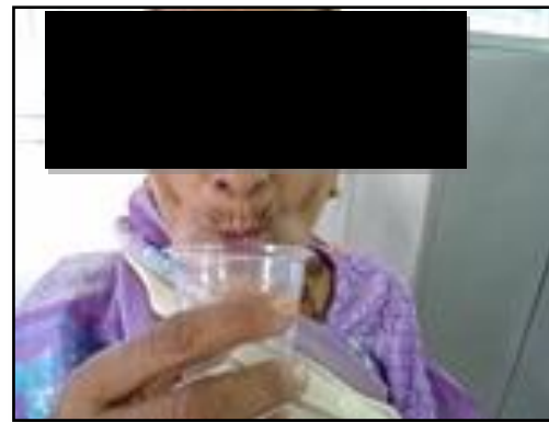
Figure 4(c): Drinking