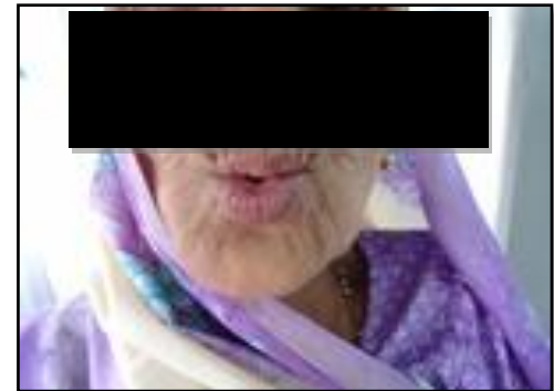
Figure 4(d): Pronouncing sound ooo

After 5–10 min, the set impression was removed from the mouth and examined. (Figure 5)