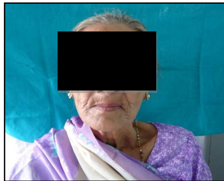
Figure-1: Patient with edentulous and severely resorbed mandibular ridge

A female patient aged about 62 years reported with a completely edentulous and severely resorbed mandibular ridge (Figure 1).