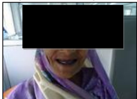
Figure 4(b): Pronouncing sound eee