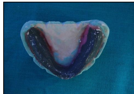
Figure 5: Set impression

After 5–10 min, the set impression was removed from the mouth and examined. (Figure 5)