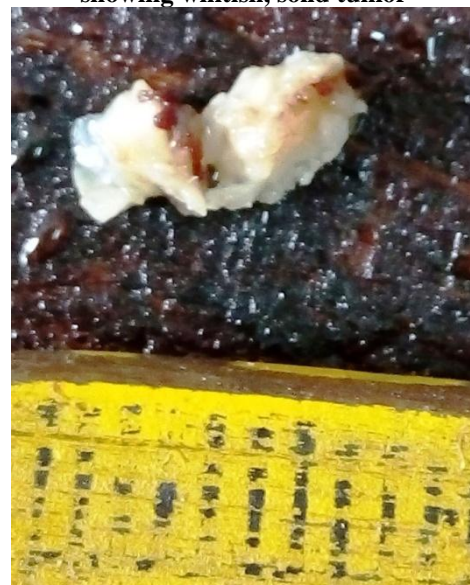
Figure 1: gross photograph of cut section of tissue showing whitish, solid tumor

resected specimen is single, greyish-white tissue, measuring 1.2 x 0.8 x 0.5 cm. Cut section is solid, white and homogenous (Figure -1). Microscopy revealed a well encapsulated mass (Figure-2) having cellular area comprising of bland spindle cells (Antoni A) and loose myxoid area (Antoni B) (Figure -3). Verocay body and thick hyalinised blood vessels are also seen. Histopathological diagnosis of Schwannoma was made and confirmed by immunohistochemistry (S100).