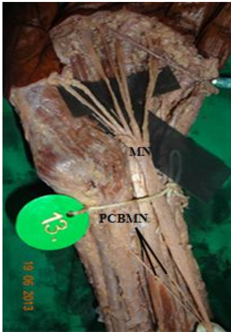
PCBMN- Palmar cutaneous branch of median nerve, MN - Median Nerve, FR- Flexor Retinaculum