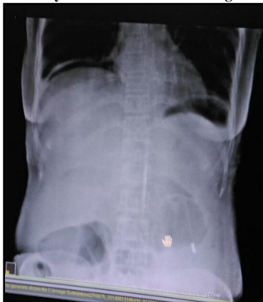
Figure 1- Erect X-ray abdomen - Gas under Right hemidiaphragm