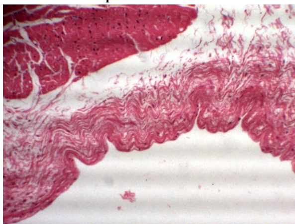
Figure 4: Elastic fibres in epicardium