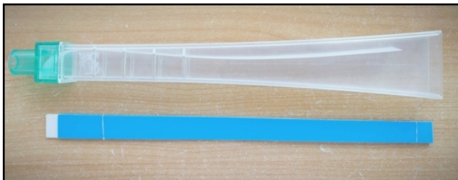
Figure 1.1 Lung Flute Device

This case study describes the effectiveness of the Lung Flute Device that plays an important role in removal of secretions thus improving the pulmonary function of the patient.