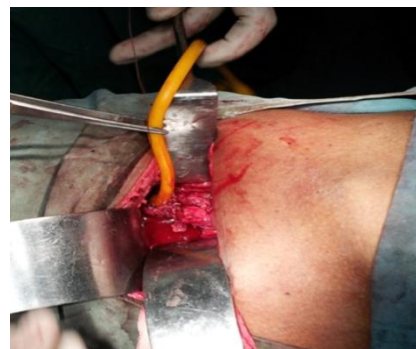
Fig 3: left nephrostomy with Foley’s catheter