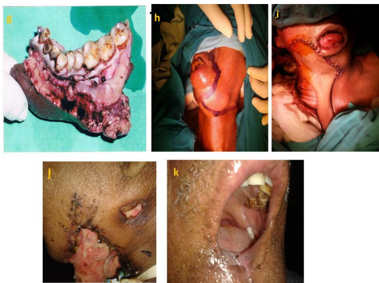
Figure 3: g) Specimen of mandible after hemimandibulectomy in patient of carcinoma of Alveolus, h) Y shape incision taken for reconstruction, i) Intro operative image of PMMC flap in patient of Carcinoma buccal mucosa, j) Marginal flap necrosis seen after reconstruction with PMMC flap, k) Recurrence seen in operated case of carcinoma buccal mucosa

As regards to surgical outcomes of the study, 22 (73.33%) patients were satisfied with surgical procedures and not having disfigurement but 8 (26.67%) patients were not satisfied with surgical procedure because of flap necrosis, recurrence wound infection and seroma formation.