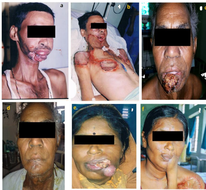
Figure 1: a) Pre operative patient of carcinoma cheek (buccal mucousa), b) Post operative patient of carcinoma cheek (buccal mucousa) reconstruction done with PMMC flap, c) Pre operative patient of carcinoma of lip, d) Post operative patient of carcinoma of lip after wide local excision with modified radical neck dissection done, e) Pre operative patient of Carcinoma of Alveolus, f) Post operative patient of Carcinoma of Alveolus After reconstruction with PMMC flap

Presence of oral lesion in the form of growth and ulcer was the most common complaint noted which accounted for 83.33% of cases, from which most of the patients (46.67%) presented with growth as a presenting symptoms followed by 36.67% presented with ulcer. Other complaints included growth plus pain (6.67%), pain (3.33%), growth with node (3.33%) and growth with ulcer (3.33%). Buccal mucosa was the most common site of oral cancer (50%), (Fig 1a and 1b) followed by oral tongue (30%), and then lips (13.33%), (Fig 1c and 1d) and alveolus (6.67%), (Fig 1e and 1f). Most of the patients of oral cancer from Stage 1 (11, 36.7%) and Stage 2 (17, 56.7%) and only 2 patients (6.7%) had Stage 3 oral cancer.