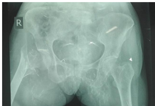
Figure 1: Pre-op - unstable IT fracture

For PFN, the nail diameter was determined by measuring diameter of the femur at the level of isthmus on an AP X-ray and a standard length PFN (250 mm) was used in all our cases. Neck shaft angle was measured in unaffected side in AP X-ray using goniometer. (as shown in figure 1- Pre-operative X ray and figure 2 – Post-operative X ray)