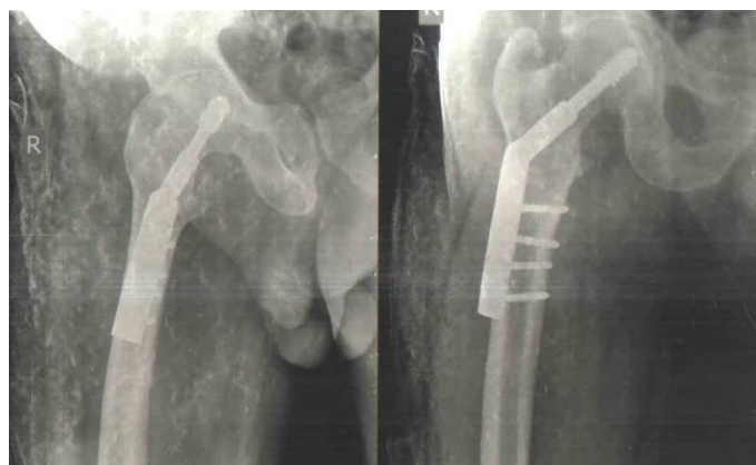
Figure 4: Post-op – Dynamic hip screw

Post-operatively, all patients were subjected to physical methods such as early mobilization. Patients were encouraged for ankle and calf exercises from day one and mobilized non-weight bearing from the second post-operative day depending upon pain tolerance of the patient. Surgical site suction drain was removed after 24 hr. The wound was inspected on the 3rd and 6th post-operative day. Stitches were removed on the 11 th -13 th day. Patients followed up at 4 weeks, 8 week, 12 weeks, 6 months and annually thereafter.