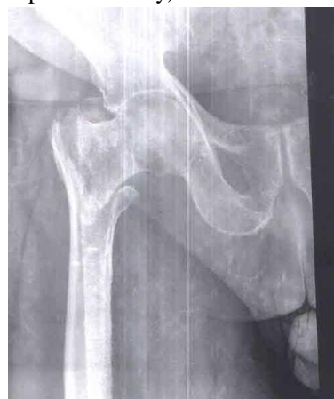
Figure 3: Pre-op - unstable IT fracture

For DHS length of compression screw was measured from tip of the head to the base of greater trochanter on AP view X-ray. Neck shaft angle was determined using goniometer on X-ray AP view on unaffected side and length of side plate was determined to allow purchase of at least 8 cortices on the shaft, distal to the fracture. (As shown in figure 3-Pre-operative X ray and figure 4– Post-operative X ray)