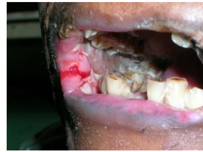
Figure 15: Post operative flap