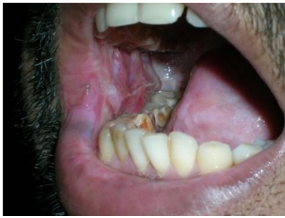
Figure 12: Mucosalization of graft