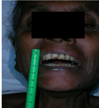
Figure 13: Preoperative mouth opening