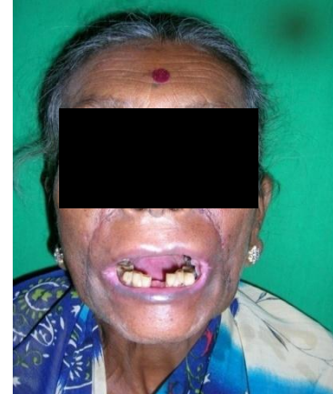
Figure 16: Post operative mouth opening