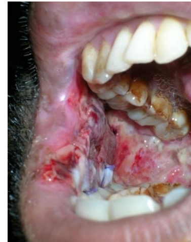
Figure 9: Partial graft loss