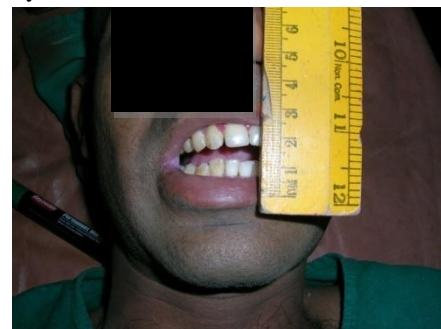
Figure 1: Preoperative mouth opening

Infiltration of the incision from the pre-auricular region extending to the temporal region was done 10 min prior to the incision. Dissection was performed in the sub follicular plane to develop the superficial temporal fascia flap to its maximum limit. Sub periosteal dissection was performed over the zygomatic arch and the zygomatico maxillary area. The origin of the masseter muscle was released completely from the zygomatic arch and the zygomatic process of the maxillary bone. This allowed partial release of the fibrosis. The dissection was carried along the coronoid process. Insertion of the temporalis muscle was released from the coronoid process and the anterior border of the ramus of the mandible. An intraoral incision was made to release the mucosa, buccinator muscle, and pterygomandibular raphe. This procedure was repeated on the opposite side allowing complete release of submucous fibrosis with full mouth opening. A superficial temporal fascia flap was elevated from the pericranium and the deep temporal fascia. The flap was pedicled on the superficial temporal vessels and turned over the zygomatic arch and brought intraorally to fill in the defect. Split skin graft harvested from the thigh was sutured over the flap intraorally, covering the defect and was immobilised with a tie over dressing. The tie over dressing was removed on the fifth post-operative day.