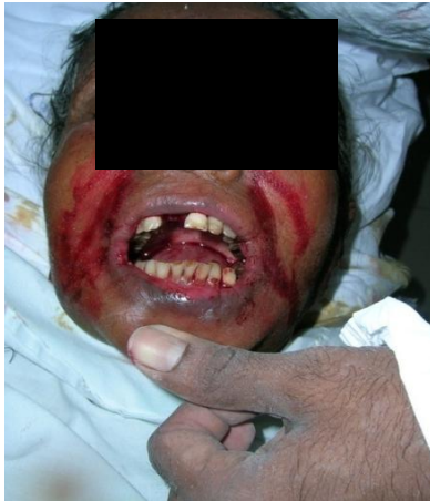
Figure 14 Nasolabial flap design