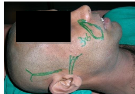
Figure 2: Marking of pedical and flap