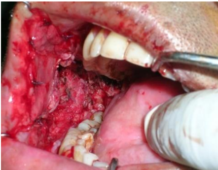
Figure 6: Flap inset and grafting