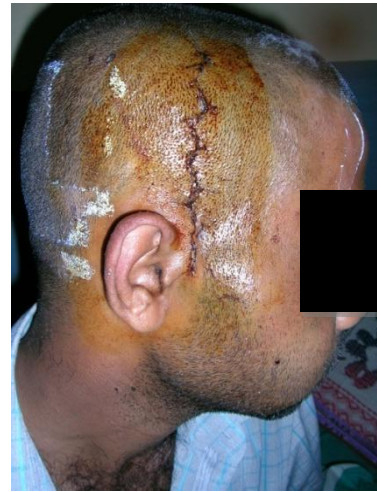
Figure 8: Donor site closure