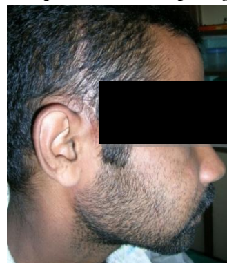
Figure 11: Donor site at 6 months