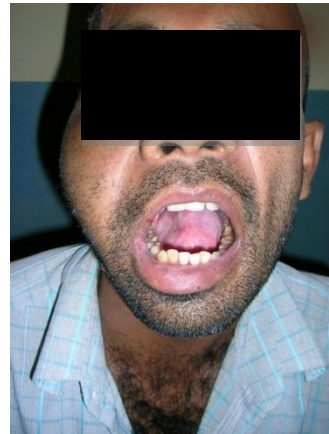
Figure 10: Post operative mouth opening at 6 months