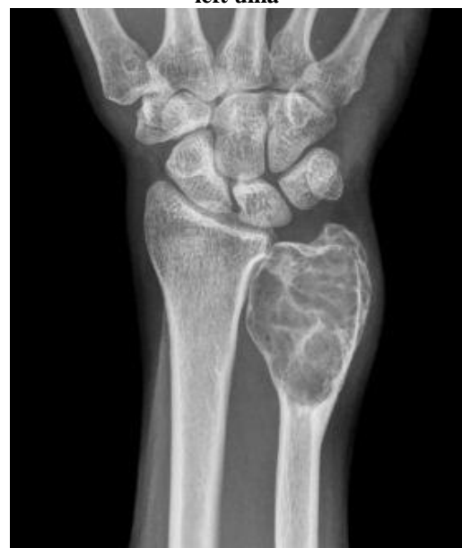
Figure 1: Preoperative plain X-ray showed an expansile and radiolucent in the distal end of the left ulna

heterogenous signal intensity mass of size 5 x 3.5 x 3 cm with heterogeneously enhancing solid area and peripherally enhancing cystic area containing fluid-fluid level within in distal part of right ulna reaching upto articular surface causing its expansion with cortical thinning. A diagnosis of giant cell tumour was made which was confirmed on biopsy. The tumour was graded as stage 3 (aggressive) on Enneking's staging system for benign tumours.