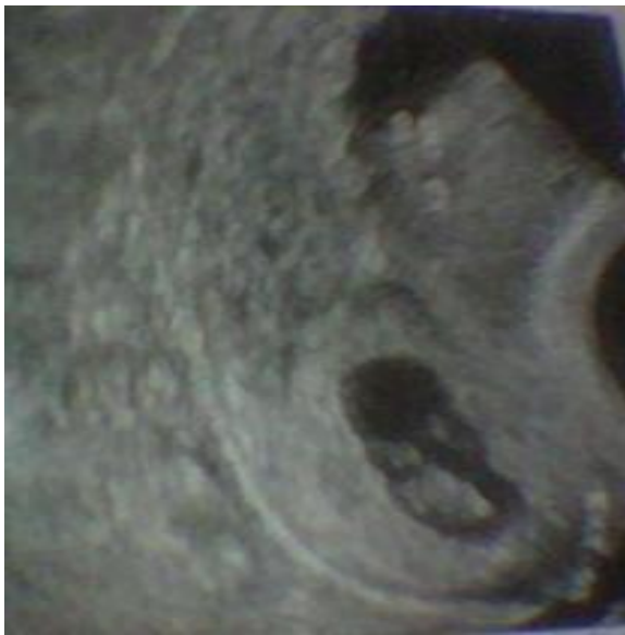
Figure 2: Increased peritrophoblastic blood flow around conceptus seen in the second case