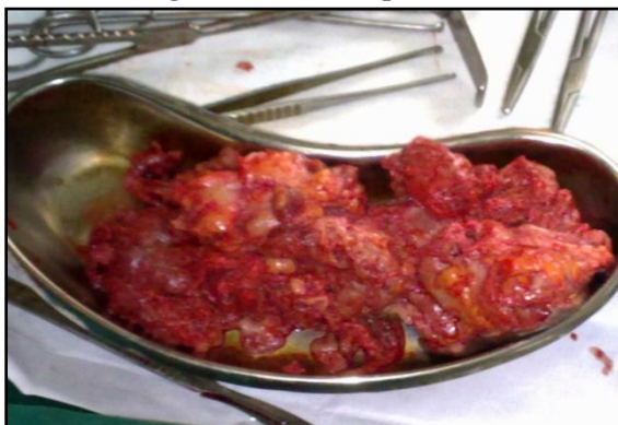
Figure 3: Excised Specimen