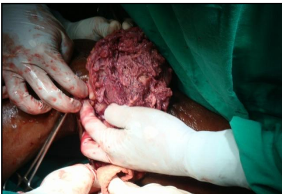
Figure 3: Excised Specimen