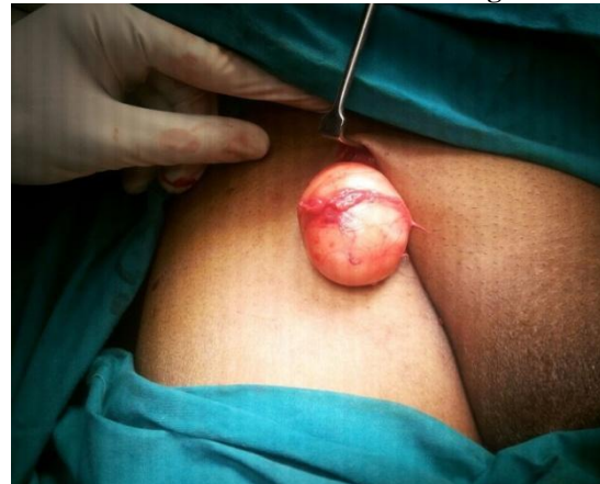
Figure 4: Complete mass (Mass abdomen, femoral part, and inguinal component) after excision.