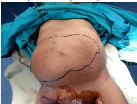
Figure 1: Markings showing mass size