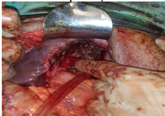
Figure 5: specimen of left hepatic mass