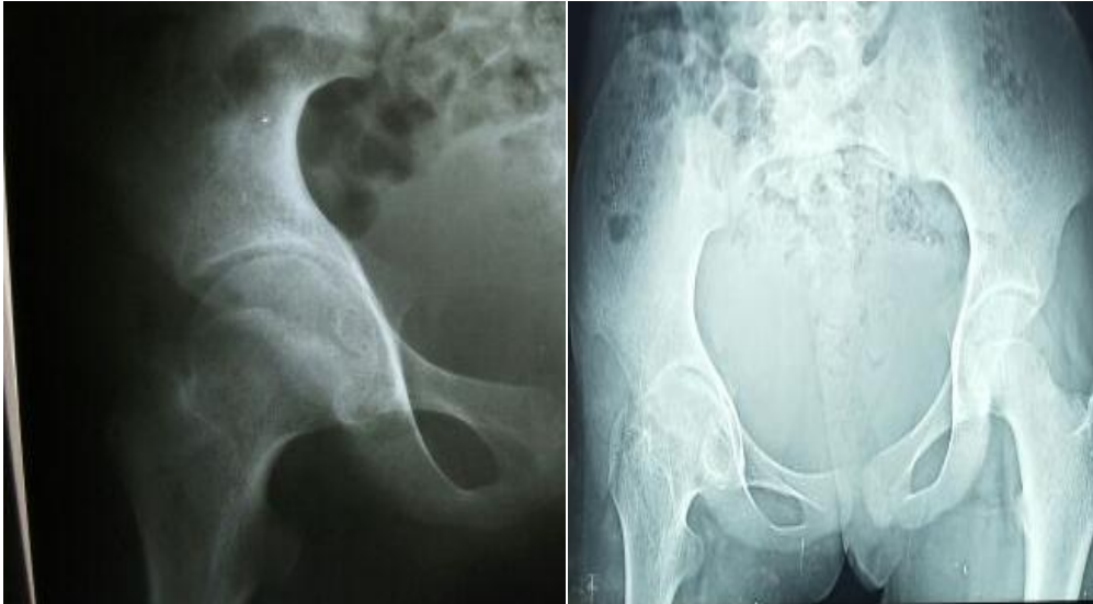
Figure 2: Radiograph of uncemented total hip after replacement