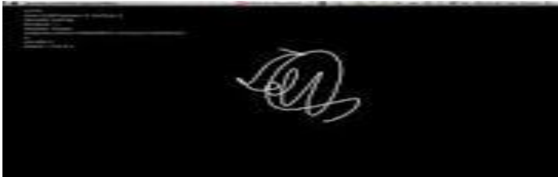
Figure 2: Gray image

every pixel there correspond 3 values. whereas in greyscale each pixel is a shade of gray, normally from 0 (black) to 255 (white). This range means that each pixel can be represented by eight bits, or exactly one byte. Other greyscale ranges are used, but generally they are a power of 2, so, we can say gray image takes less space in memory in comparison to RGB images.